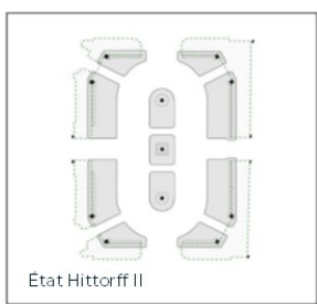
Main historical developments in the market

Taking account of these different historical states will be a major element in the future project management's thinking, through the two major historical markers of the square: the Gabriel state, which was accompanied by the development of planted flowerbeds in addition to the ditches, and the "Hittorff 1" state of 1836, constituting a reference state in terms of the furniture and statuary that appeared during this redevelopment (fountains, rostral columns, etc.).